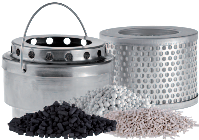
Adsorption and filter insert as well as various adsorbents