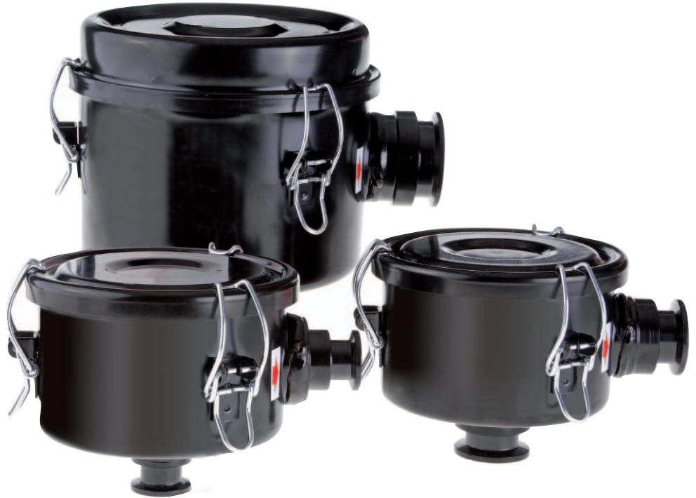
Filter casing (empty), for optional equipping