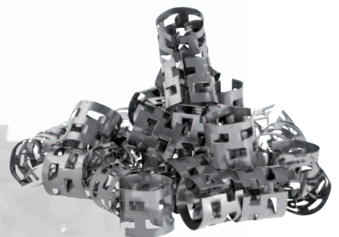
Pall rings made of stainless steel 1.4301

* During the regeneration phase we recommend the use of a second adsorption insert.