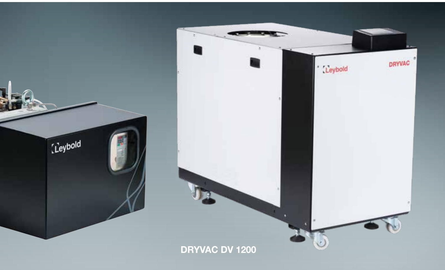
DRYVAC DV 1200